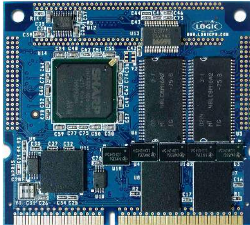
Actual Size (2.37" x 2.67")