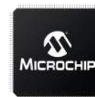
144-lead LQFP (PL) 20 × 20 × 1.4 mm