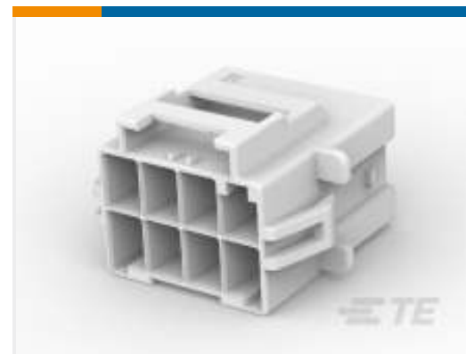
TE Part #1-1971772-4 Standard Temperature Caps | POWER TRIPLE LOCK