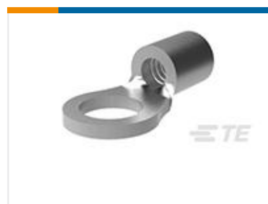
TE Part #2-35771-1 TERMINAL, SOLIS R 12-10 10