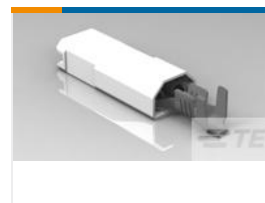
TE Part #521284-1 ULTRA-POD 187 ASSY REC 20-16 AWG BR