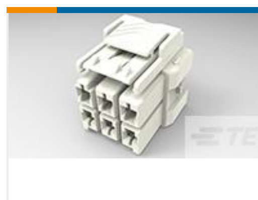
TE Part #1-1971776-3 PTL 2X3 PLUG HSG STD TEMP KEY A NAT