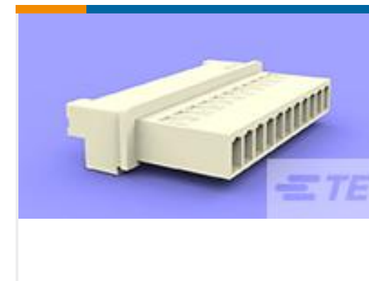
TE Part #1969588-6 HSG, REC, FREE-HANGING, SINGLE ROW, EP2.5