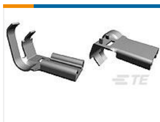
TE Part #1742626-1 250 FASTON, FLAG, REC., 16-14 AWG, NPST