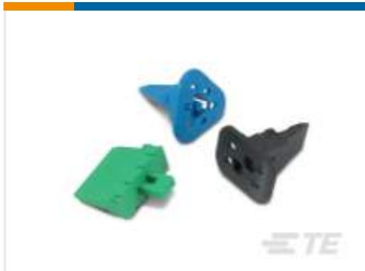
TE Part #W2P Wedgelocks: DEUTSCH DT