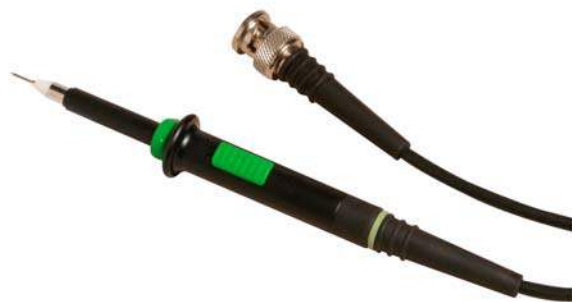
Model 6494 Modular Passive Oscilloscope Probe with Readout Actuator