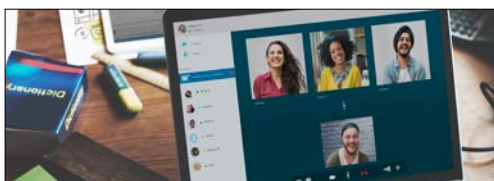
5G Networking/Telecommunications Communication Modules (WiFi Routers and Mesh Devices)