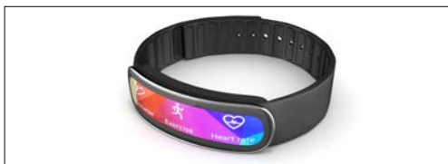
Wearables (Smart Watches, Health Monitors, AR & VR)