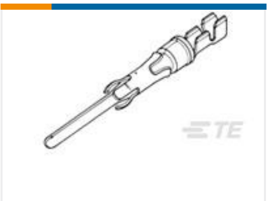
TE Part #164161-4 M-SRS.PIN BODY 3+