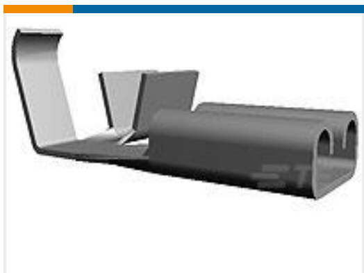
TE Part #61372-1 110 FASTON FLAG REC 22-18 AWG TPBR