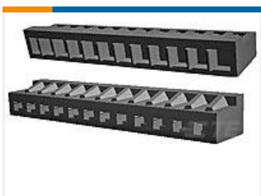
TE Part #172890-3 3P 2MM MINI AMP-IN HDR HSG