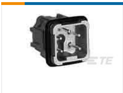
TE Part #1-1103402-1 HA.4.Sti.S