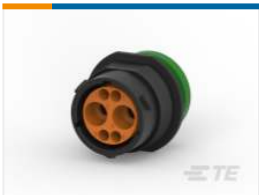
TE Part #HDP24-18-6PN-L017 REC, 6P, BLK, N, RNG, 4/16, P