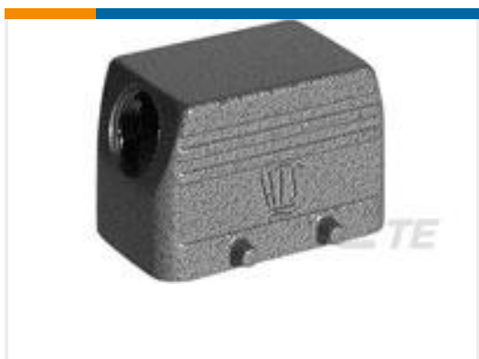
TE Part #2-1106430-4 HB.10.STS.1.M20.G