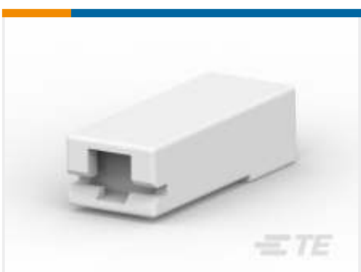
TE Part #480435-1 187 FASTON HSG. REC 1P NATURAL