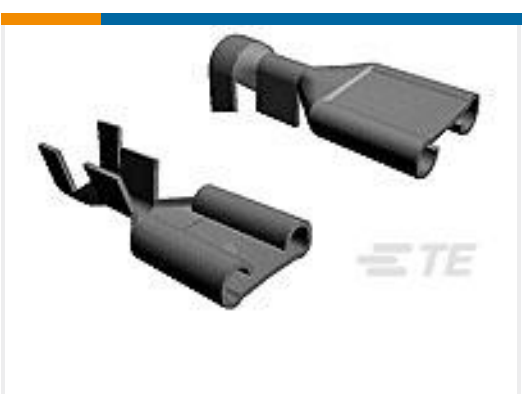
TE Part #60650-2 250 FASTON FLAG REC 18-14 AWG TPBR