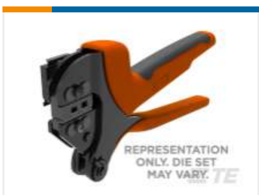
TE Part #2389862-1 SDE F PIN/SOC SOLARLOK PV4 6-4 ASSY