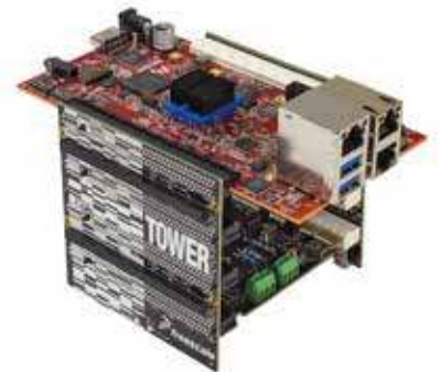
Figure 1. TWR-LS1021A module (TWR-LS1021A, TWR-SER-IO and TWR-ELEV)