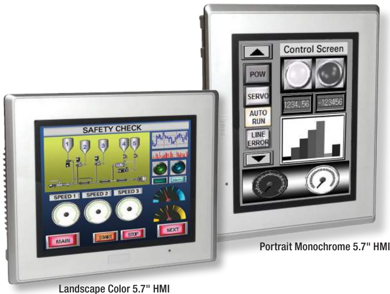
Landscape Color 5.7" HMI