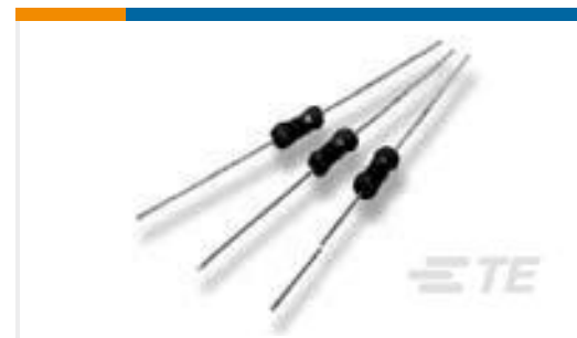
TE Part #3-1625892-7 3W SM M/OX 5% 2K2