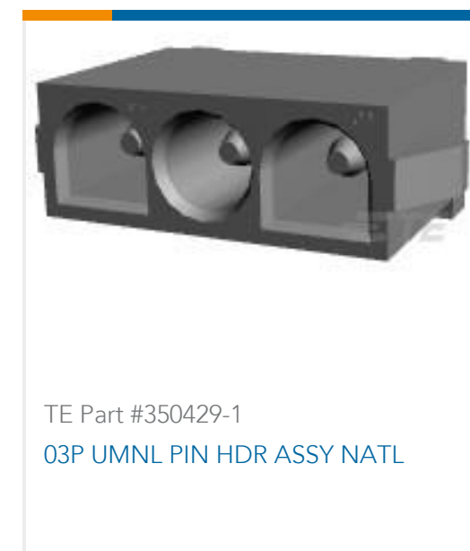
TE Part #350429-1 03P UMNL PIN HDR ASSY NATL