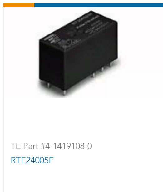
TE Part #4-1419108-0 RTE24005F