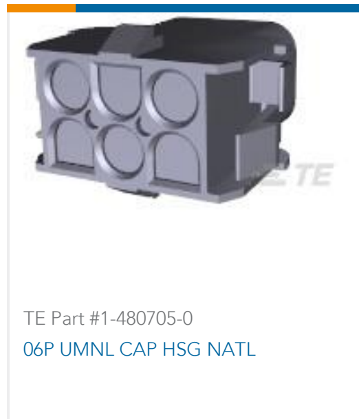
TE Part #1-480705-0 06P UMNL CAP HSG NATL