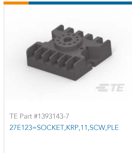
TE Part #1393143-7 27E123=SOCKET,KRP,11,SCW,PLE