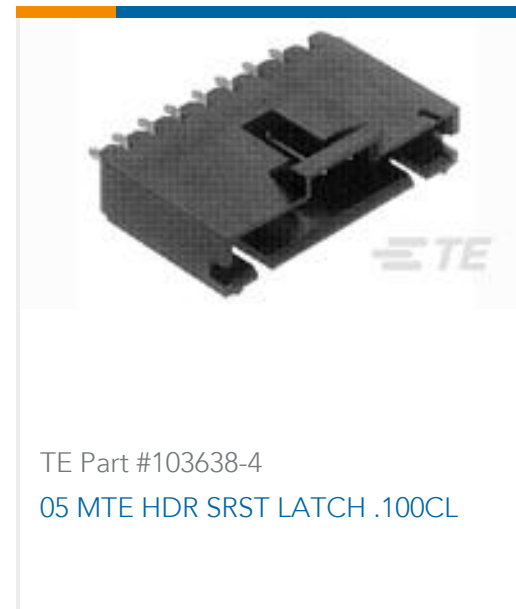
TE Part #103638-4 05 MTE HDR SRST LATCH .100CL