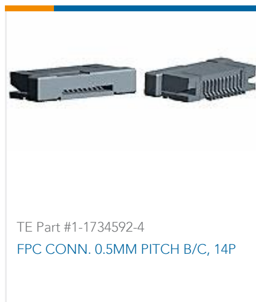
TE Part #1-1734592-4 FPC CONN. 0.5MM PITCH B/C, 14P