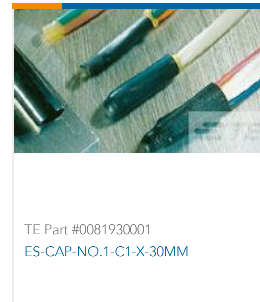
TE Part #0081930001 ES-CAP-NO.1-C1-X-30MM