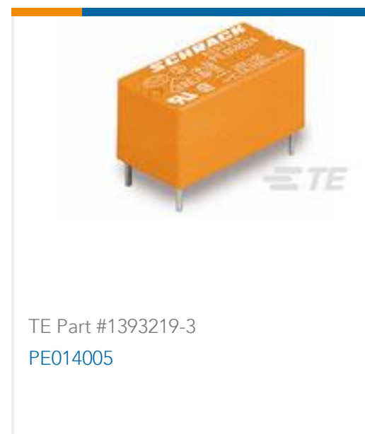
TE Part #1393219-3 PE014005