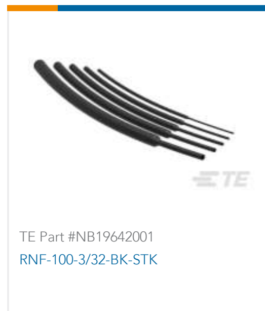
TE Part #NB19642001 RNF-100-3/32-BK-STK