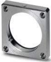
Square mounting flange, 4xM3

Please be informed that the data shown in this PDF Document is generated from our Online Catalog. Please find the complete data in the user's documentation. Our General Terms of Use for Downloads are valid ( http://download.phoenixcontact.com )