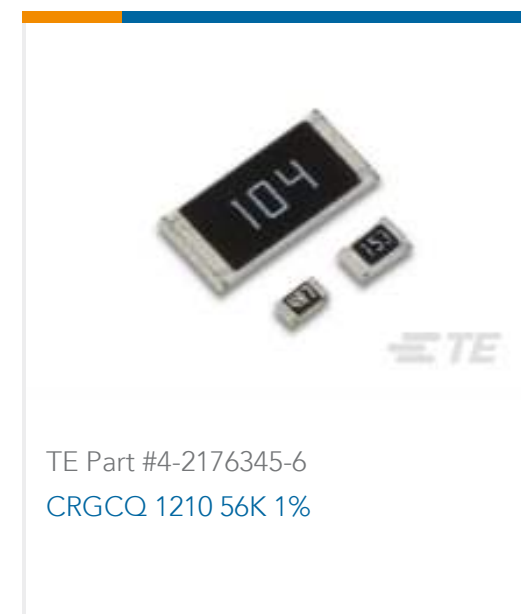
TE Part #4-2176345-6 CRGCO 1210 56K 1%