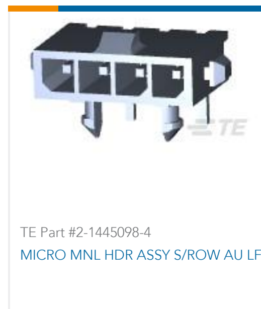
TE Part #2-1445098-4 MICRO MNL HDR ASSY S/ROW AU LF