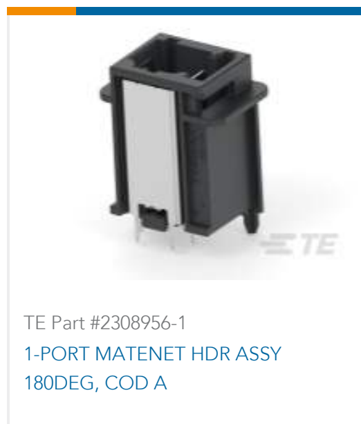
TE Part #2308956-1 1-PORT MATENET HDR ASSY 180DEG, COD A