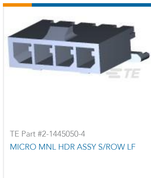
TE Part #2-1445050-4 MICRO MNL HDR ASSY S/ROW LF