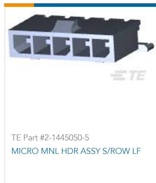
TE Part #2-1445050-5 MICRO MNL HDR ASSY S/ROW LF