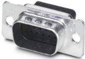
D-SUB contact carrier, shell size 1, for 15 signal contacts, contact type pin, for crimp contacts, straight, fixing with a 3 mm hole, for panel mounting frame and sleeve housing VS-09-...

Please be informed that the data shown in this PDF Document is generated from our Online Catalog. Please find the complete data in the user's documentation. Our General Terms of Use for Downloads are valid ( http://phoenixcontact.com/download )