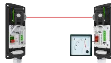
Alignment by voltage