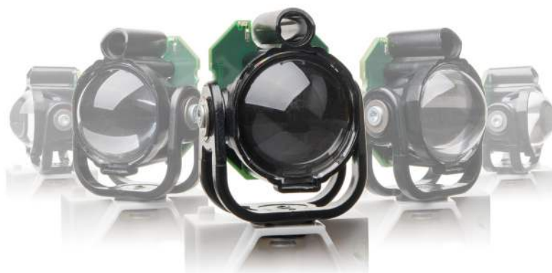
Easy mechanical Horizontal adjustment