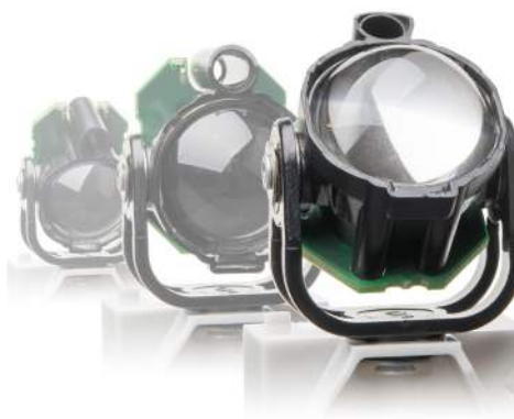
Easy mechanical Vertical adjustment