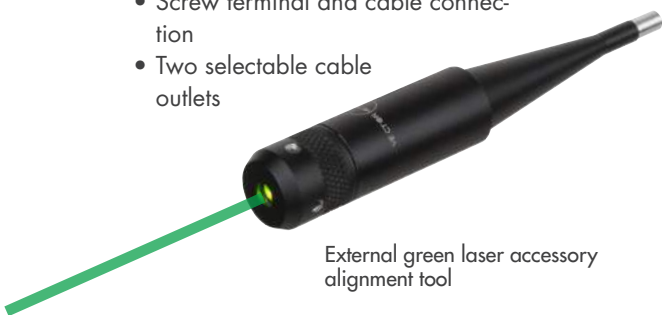
External green laser accessory alignment tool