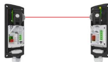
Alignment by blinking LED