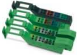
Connector set for Inline bus coupler, color-coded

Please be informed that the data shown in this PDF Document is generated from our Online Catalog. Please find the complete data in the user's documentation. Our General Terms of Use for Downloads are valid ( http://phoenixcontact.com/download )