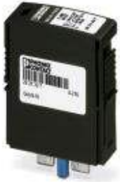
Type 2 surge protection plug with N-PE total current spark gap.

Please be informed that the data shown in this PDF Document is generated from our Online Catalog. Please find the complete data in the user's documentation. Our General Terms of Use for Downloads are valid ( http://phoenixcontact.com/download )