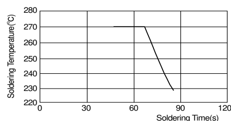
[Allowable Reflow Soldering Temperature and Time]

In the case of repeated soldering, the accumulated soldering time must be within the range shown above.