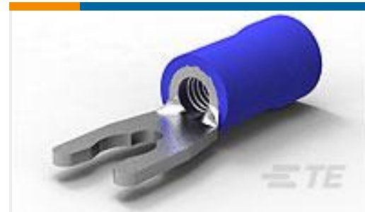
TE Part #52955-1 TERMINAL,PG SPR SPD 16-14 6