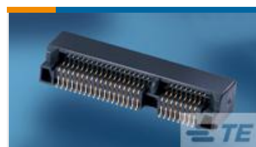
TE Part #1775838-2 mSATA/mini PCI-E 5.6H Type I G/F