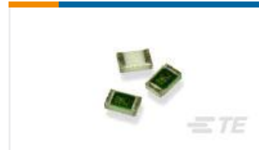
TE Part #5-1879337-9 CPF 0603 10K 1% 50PPM 1K RL