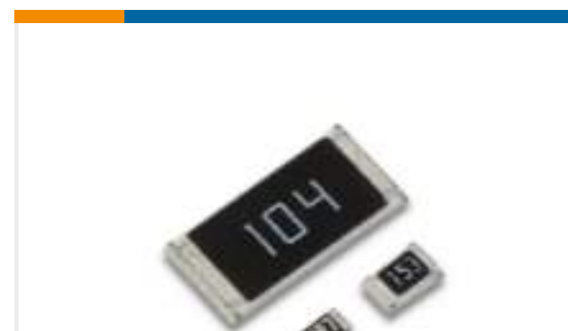
TE Part #3-2176337-1 CRGCO 0402 3K3 1%