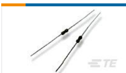
TE Part #1-1623708-2 RGP0207CH 10% 1G0