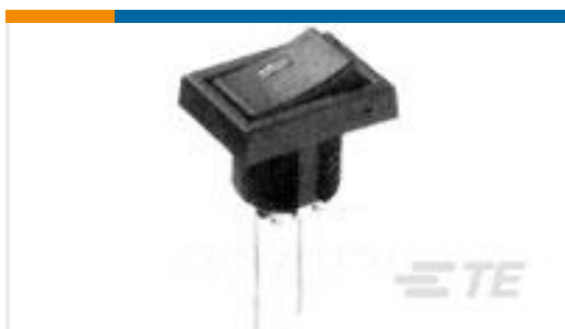
TE Part #4-1437595-1 TRD11D10WL=SPDT ROCKER BLACK