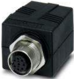
Control cabinet feed-through, M12, 8-pos., A-coded on RJ45 socket, socket input 180°, IP65/67

Please be informed that the data shown in this PDF Document is generated from our Online Catalog. Please find the complete data in the user's documentation. Our General Terms of Use for Downloads are valid ( http://download.phoenixcontact.com )