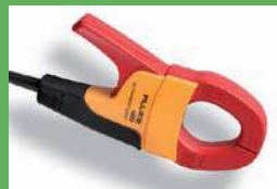
i400 Current Clamp

For more information on how the Fluke 289 True-rms Industrial Logging Multimeter with TrendCapture can help you, go to www.fluke.com/289 .