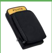
C781 Soft Meter Case