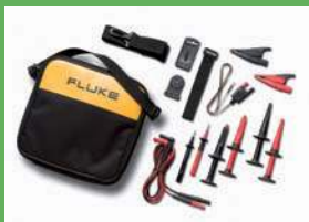
TLK289 Electronic Test Lead Kit