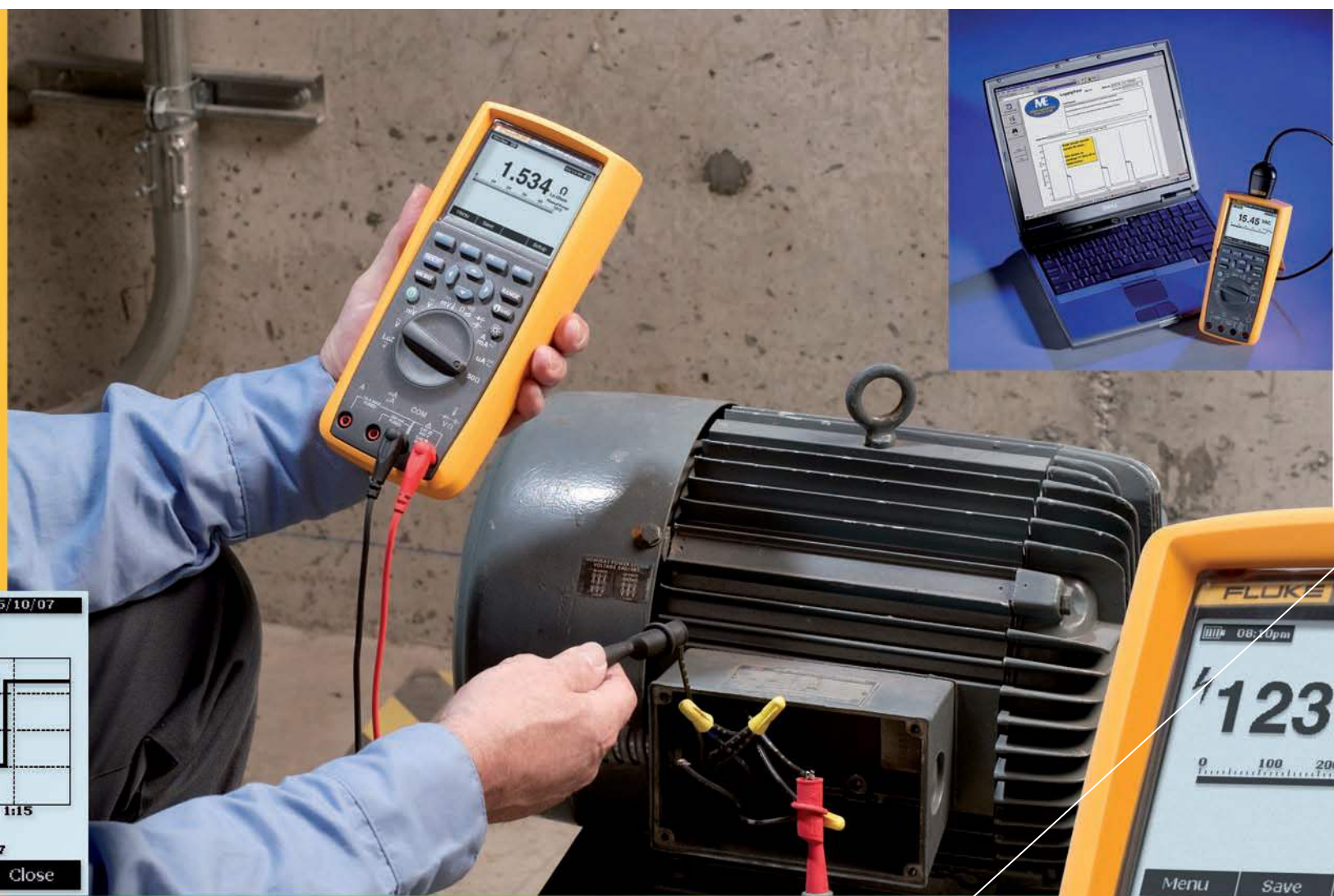
Transfer data to PC using optional cable and FlukeView Forms Software