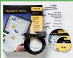
FlukeView® Forms Software and Cable

A wide array of accessories is available to help you maximize the productivity of the Fluke 289 but the following are essential for most users.