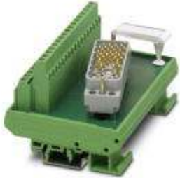
VARIOFACE module, for ELCO connector, for mounting on NS 35/7.5 or NS 32, with pin strip 8016 left, no. of positions 32

Please be informed that the data shown in this PDF Document is generated from our Online Catalog. Please find the complete data in the user's documentation. Our General Terms of Use for Downloads are valid ( http://phoenixcontact.com/download )