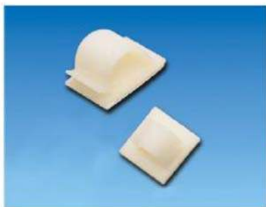
Adhesive clips come in pairs connected together on adhesive liner.