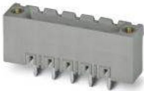
The figure shows a 5-pos. version of the product in gray

Header, Nominal current: 12 A, Rated voltage (III/2): 320 V, Number of positions: 5, Pitch: 5 mm, Color: black, Contact surface: Tin, Mounting: Wave soldering