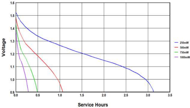
Coppertop AAA - Constant Power