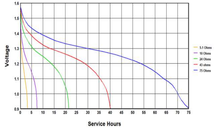
Coppertop AAA - Constant Resistance