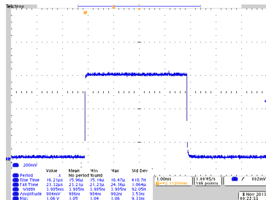
1 A, 13 V compliance, 20 Hz, 4000 \mu s pulse width