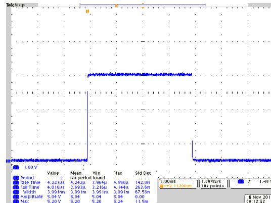
5 A, 17 V compliance, 20 Hz, 4000 \mu s pulse width