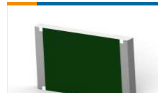
TE Part #8-2176407-8 3560 27R 5%