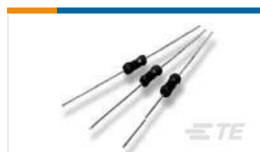
TE Part #4-1879350-2 RR01 5% 11R AMMO