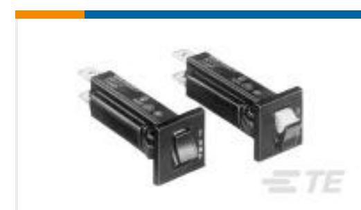
TE Part #1-1393250-7 W28-XQAT-15=W28