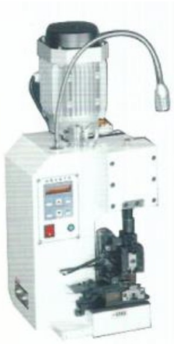
FLH-CT-0-02 CRIMP MACHINE WITH APPLICATOR