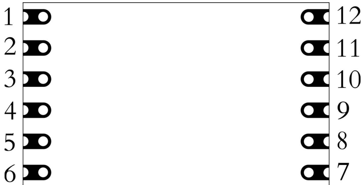
Figure 2. Pinout of the module.

The pinout of the module has been designed to provide as many interface options as possible.