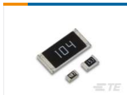
TE Part #4-2176339-7 CRGCQ 0603 68K 1%