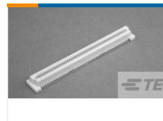
TE Part #5177983-2 0.8FH,R05H.5,060,08/Sn,TU