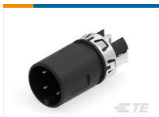
TE Part #225255-E M12 M 4 A L90H T * 301 * 188 * Y** 000