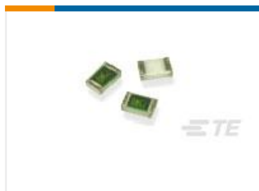
TE Part #1-2176092-6 RP 2A 0.25W 953R 0.1% 25PPM 1K RL