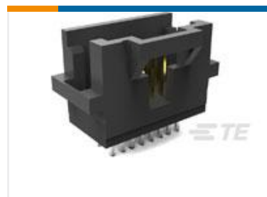
TE Part #6-104068-0 16 SYSTEM 50 HDR DRST SHRD