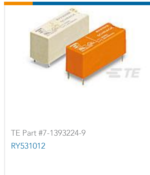
TE Part #7-1393224-9 RY531012