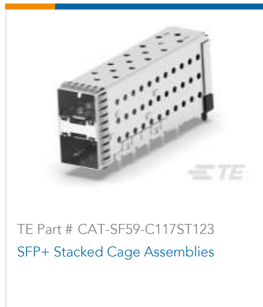
TE Part # CAT-SF59-C117ST123 SFP+ Stacked Cage Assemblies