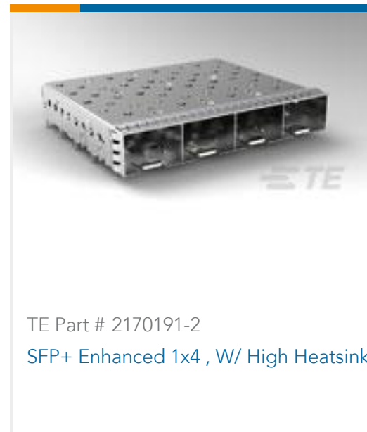
TE Part # 2170191-2 SFP+ Enhanced 1x4, W/ High Heatsink