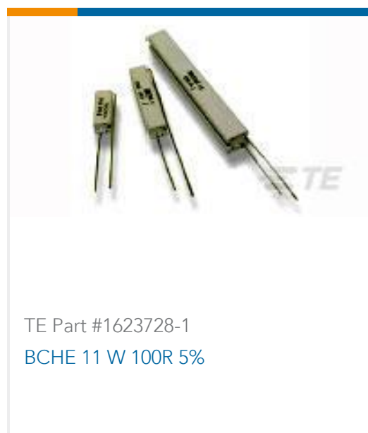
TE Part #1623728-1 BCHE 11 W 100R 5%