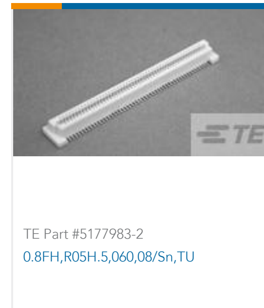
TE Part #5177983-2 0.8FH,R05H.5.060,08/Sn,TU