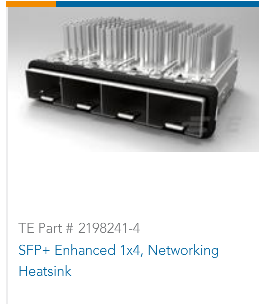
TE Part # 2198241-4 SFP+ Enhanced 1x4, Networking Heatsink