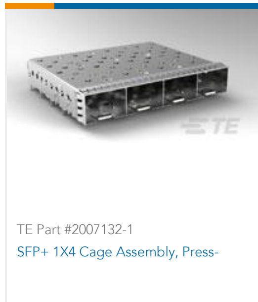
TE Part #2007132-1 SFP+ 1X4 Cage Assembly, Press-