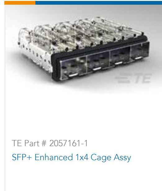
TE Part # 2057161-1 SFP+ Enhanced 1x4 Cage Assy