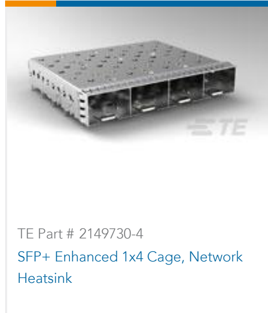
TE Part # 2149730-4 SFP+ Enhanced 1x4 Cage, Network Heatsink