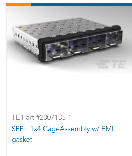
TE Part #2007135-1 SFP+ 1x4 CageAssembly w/ EMI gasket