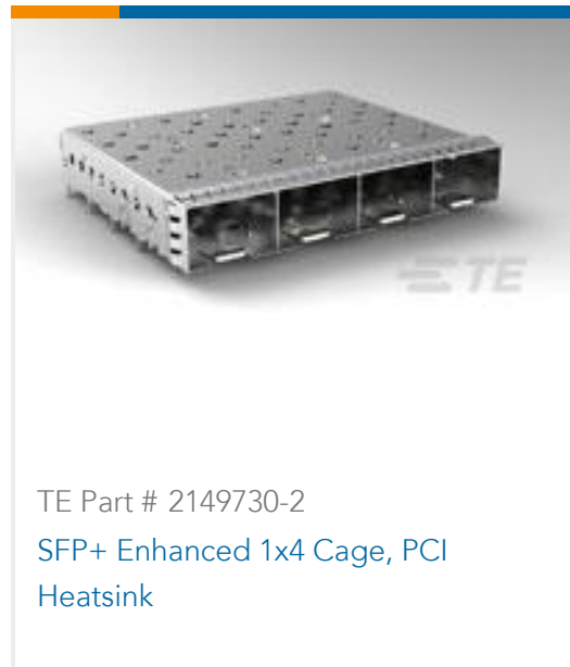
TE Part # 2149730-2 SFP+ Enhanced 1x4 Cage, PCI Heatsink