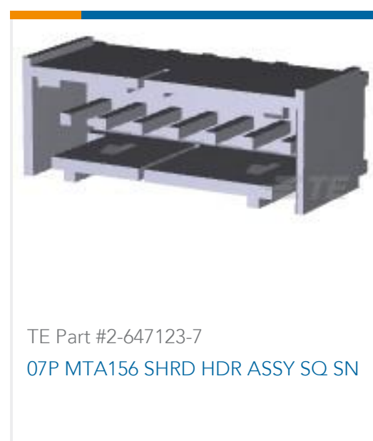
TE Part #2-647123-7 07P MTA156 SHRD HDR ASSY SQ SN