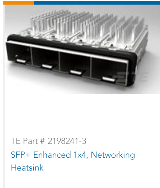
TE Part # 2198241-3 SFP+ Enhanced 1x4, Networking Heatsink