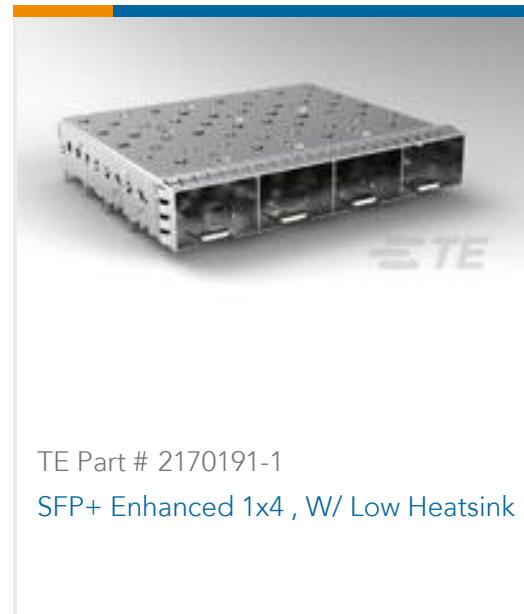
TE Part # 2170191-1 SFP+ Enhanced 1x4, W/ Low Heatsink