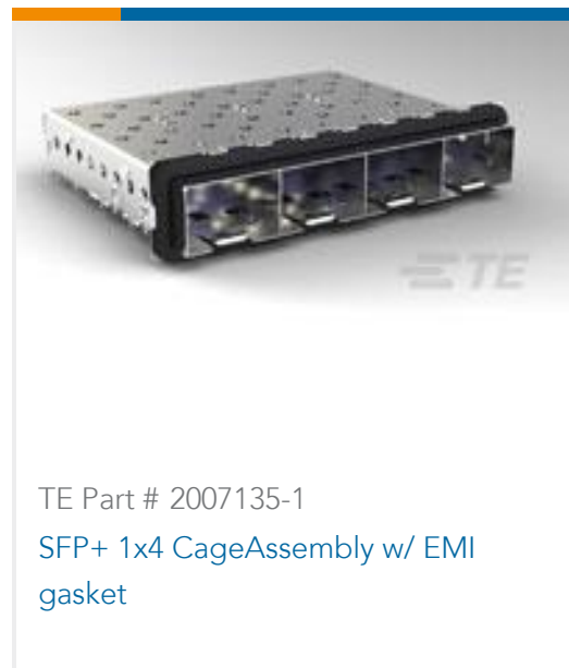
TE Part # 2007135-1 SFP+ 1x4 Cage Assembly w/ EMI gasket