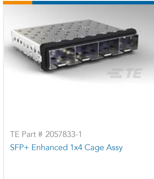
TE Part # 2057833-1 SFP+ Enhanced 1x4 Cage Assy