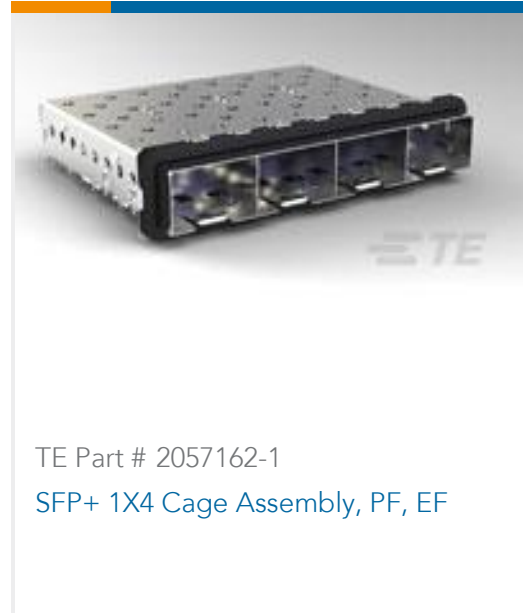
TE Part # 2057162-1 SFP+ 1X4 Cage Assembly, PF, EF