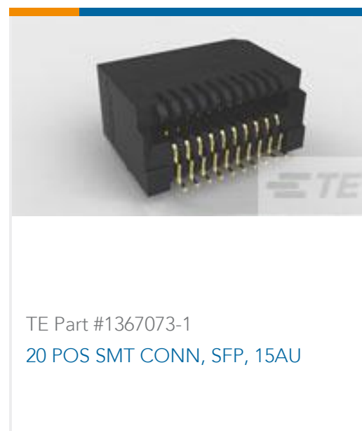
TE Part #1367073-1 20 POS SMT CONN, SFP, 15AU