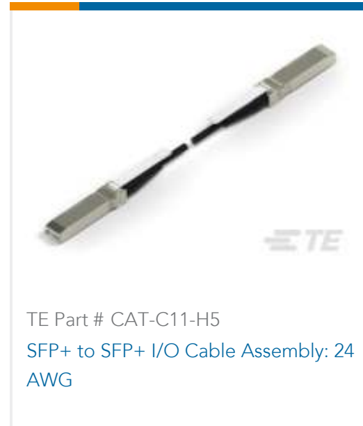
TE Part # CAT-C11-H5 SFP+ to SFP+ I/O Cable Assembly: 24 AWG