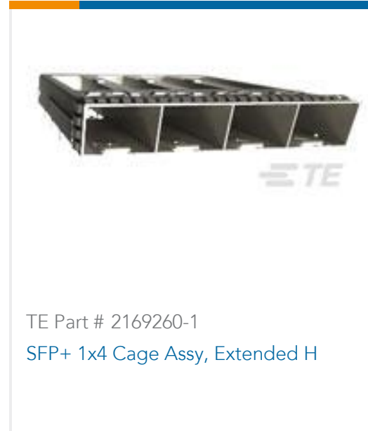
TE Part # 2169260-1 SFP+ 1x4 Cage Assy, Extended H