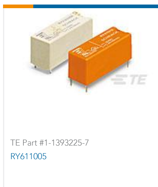
TE Part #1-1393225-7 RY611005