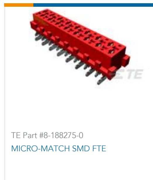
TE Part #8-188275-0 MICRO-MATCH SMD FTE