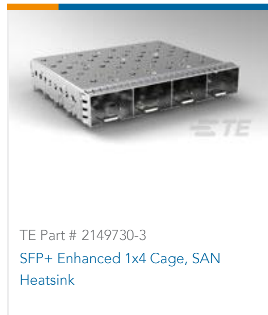
TE Part # 2149730-3 SFP+ Enhanced 1x4 Cage, SAN Heatsink