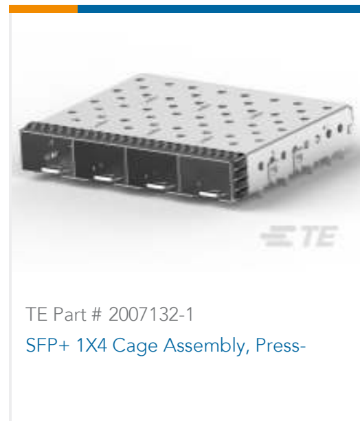
TE Part # 2007132-1 SFP+ 1X4 Cage Assembly, Press-gasket