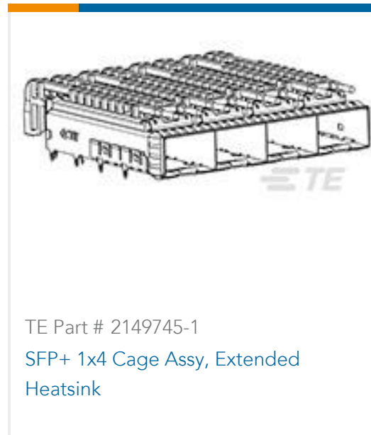
TE Part # 2149745-1 SFP+ 1x4 Cage Assy, Extended Heatsink