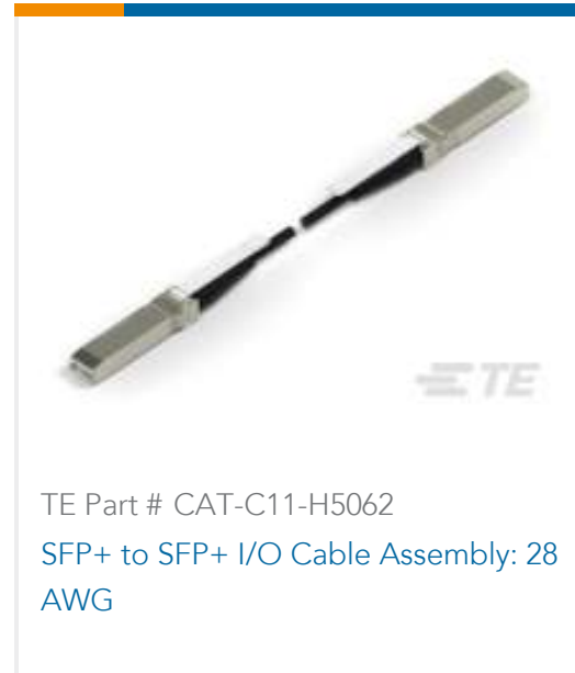
TE Part # CAT-C11-H5062 SFP+ to SFP+ I/O Cable Assembly: 28 AWG