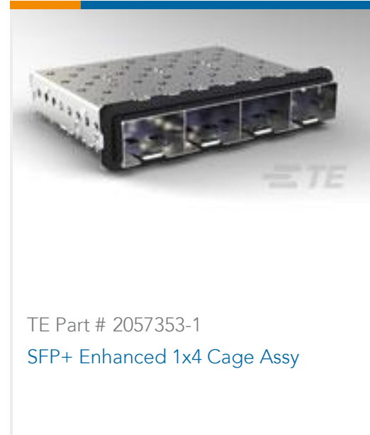
TE Part # 2057353-1 SFP+ Enhanced 1x4 Cage Assy