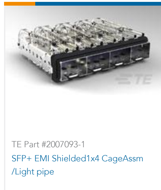
TE Part #2007093-1 SFP+ EMI Shielded1x4 CageAssm /Light pipe