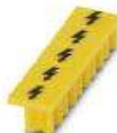
Warning cover, 5-pos., for terminal width: 5.2 mm

Zack Marker strip, flat - ZBF 5 CUS - 0825025