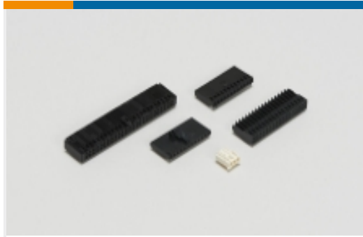
Wire-to-Board Connector Assemblies & Housings(5)