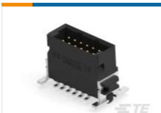
TE Part #244854-E SMCQ 12 M AB VW 8-03 CL * H007 137 E005