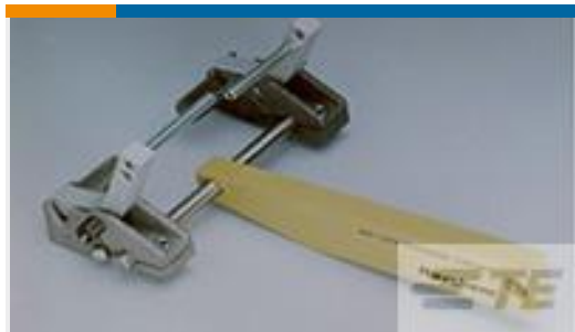
TE Part #993850-000 AD-1319-9