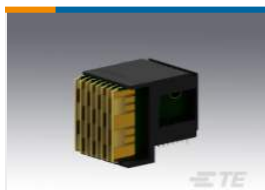
TE Part #1410971-4 MULTIGIG RT T2 7RW H-LFT RTM