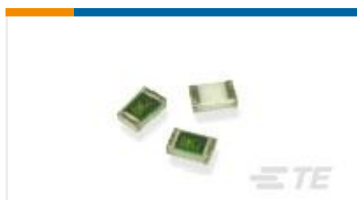
TE Part #4-2176087-3 RP 1J 0.166W 187R 0.1% 25PPM 1K RL