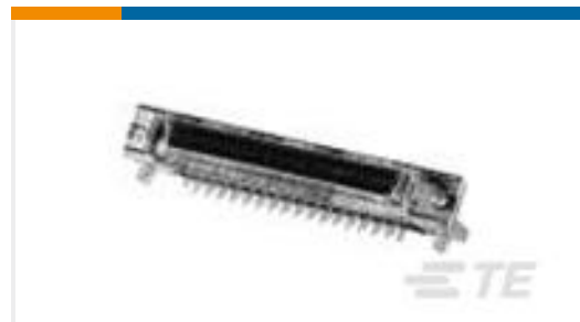
TE Part #5787190-5 50 50SR R/A RCPT ASSY, RDSN L/F