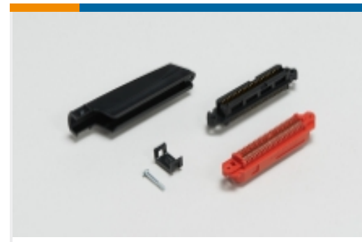
IDC D-Sub Connectors(67)