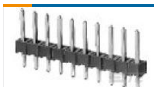
TE Part #5-146274-3 03 MODII HDR SRST B/A .100CL