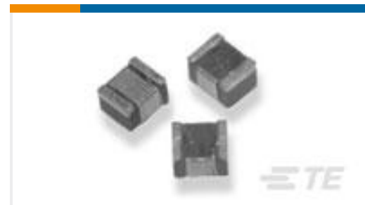
TE Part #7-1624112-2 3650 0603 8.7nH 5% 2K RL