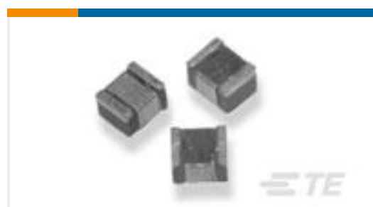
TE Part #9-1624112-4 3650 0603 0.39uH 5% 2K RL