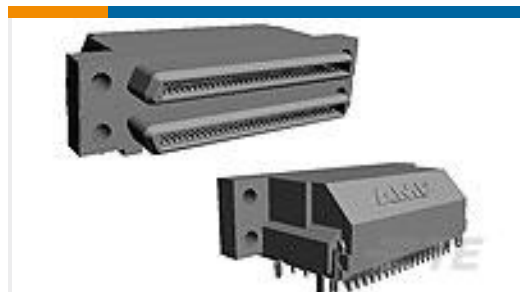
TE Part #5787962-1 .8MM CHAMP STACK RCPT ASSY