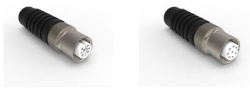
ISO VIEW M12 A-5 FEMALE CONNECTOR

*TOOL SETTING MUST BE VALIDATED ON CABLE USED