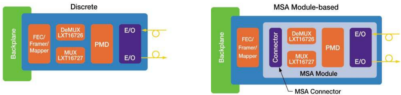
Optical Line Card Block Diagram

Intel is a leading supplier of communications building blocks, adding value at many levels of integration. Through continuous innovations and advancements in connectivity and processing in the network, Intel is delivering, along with its customers and developer community, a wide choice of solutions that enable faster time-to-market, longer time-in-market, and increased revenue opportunity.