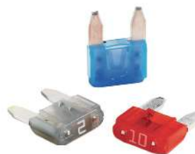
MINI Style Fuses