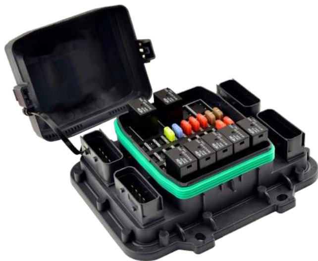
*Fuses and Relays Not Included