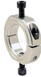
*Additional hardware #01 included