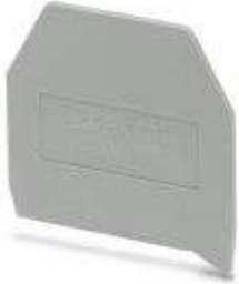
End cover, Length: 43 mm, Width: 1.5 mm, Color: gray

Please be informed that the data shown in this PDF Document is generated from our Online Catalog. Please find the complete data in the user's documentation. Our General Terms of Use for Downloads are valid ( http://phoenixcontact.com/download )