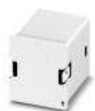
Replacement cover for slot 1 in base unit.