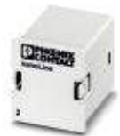
Replacement cover for slot 2 in base unit.

Covering hood - NLC-MOD-CAP-PXC - 2701292