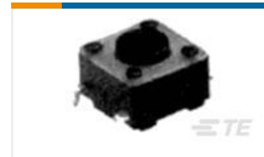
TE Part #1977223-4 FSM2JSMASSTR=6MM TACT SWITCH, SMT 160gf,