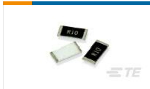
TE Part #2-1879462-7 RL73H 2B R20 1% 1K RL