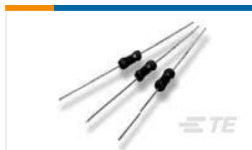
TE Part #4-1625890-5 2W SM M/OX 5% 39K