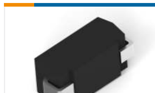
TE Part #2176323-9 SMV 2W 470K 5%