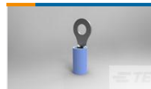
TE Part #51864-1 TERM, RT, PIDG, 16-14, #8