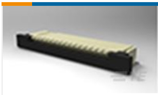
TE Part # 1-84953-7 1MM FPC HORZ.TOP CONT.ASSY 17P