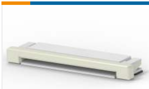
TE Part #4-1734592-0 0.5mm FPC Connectors