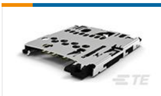
TE Part #2201778-1 MICRO SD PUSH PUSH LOW PROFILE TYPE