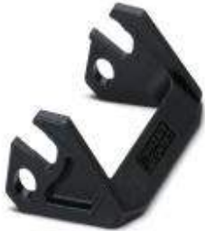
Replacement single locking latch for HEAVYCON EVO housing type B10, PA

Please be informed that the data shown in this PDF Document is generated from our Online Catalog. Please find the complete data in the user's documentation. Our General Terms of Use for Downloads are valid ( http://phoenixcontact.com/download )