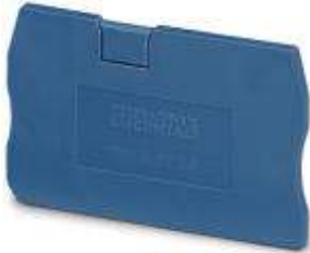
End cover, Length: 48.5 mm, Width: 2.2 mm, Height: 36.5 mm, Color: blue

Please be informed that the data shown in this PDF Document is generated from our Online Catalog. Please find the complete data in the user's documentation. Our General Terms of Use for Downloads are valid ( http://phoenixcontact.com/download )