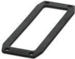
Replacement flat gasket, for HEAVYCON EVO panel mounting base type B16

Please be informed that the data shown in this PDF Document is generated from our Online Catalog. Please find the complete data in the user's documentation. Our General Terms of Use for Downloads are valid ( http://phoenixcontact.com/download )