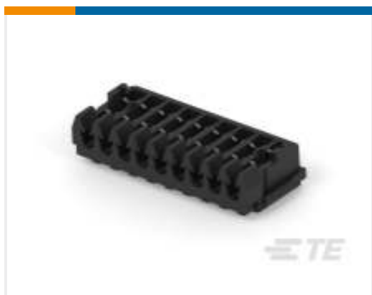
TE Part #2-353293-9 1.5MM CT MT REC ASS'Y 9P BLACK