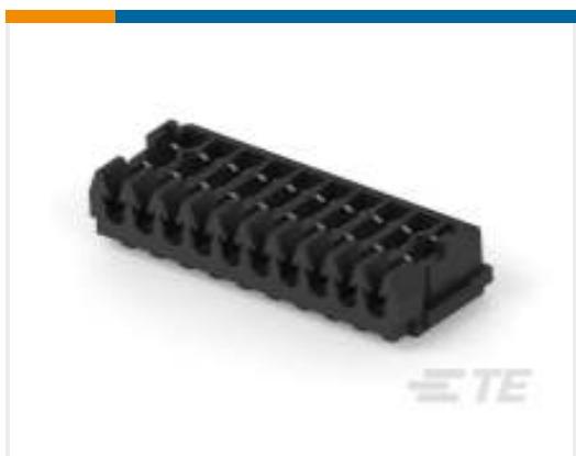
TE Part #3-353293-0 1.5MM CT MT REC ASSY 10P BLACK