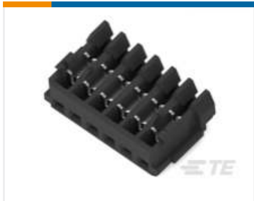
TE Part #2-353293-6 1.5MM CT MT REC ASS'Y 6P BLACK