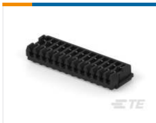
TE Part #3-353293-3 1.5MM CT MT REC ASSY 13P BLACK