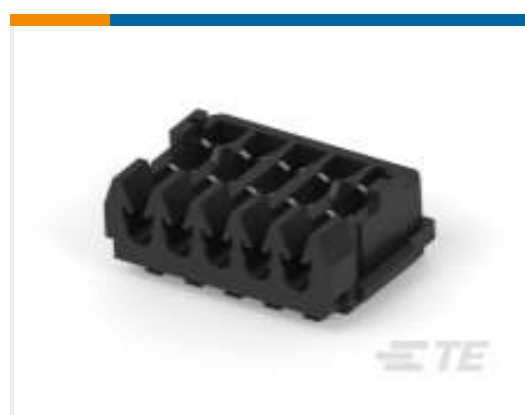
TE Part #2-353293-5 1.5MM CT MT REC ASS'Y 5P BLACK