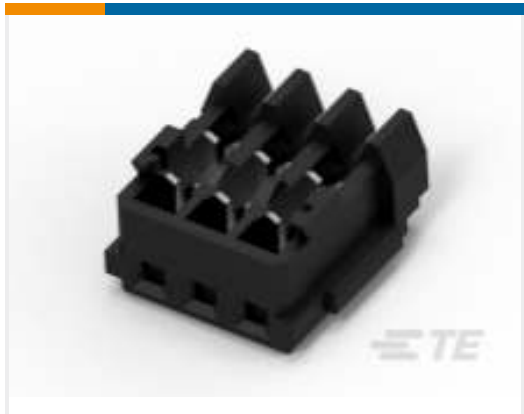
TE Part #2-353293-3 1.5MM CT MT REC ASS'Y 3P BLACK