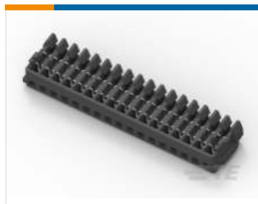
TE Part #3-353293-7 1.5MM CT MT REC ASSY 17P BLACK