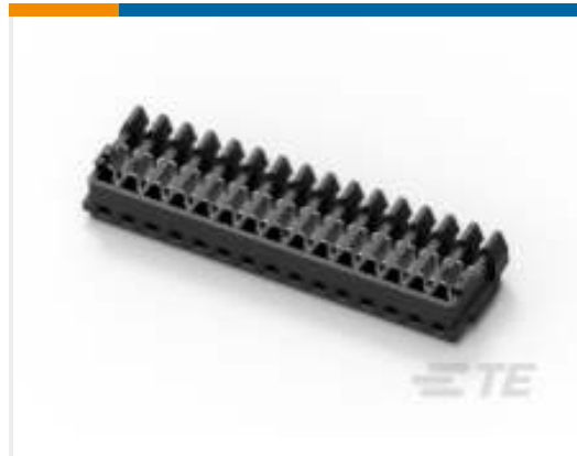
TE Part #3-353293-5 1.5MM CT MT REC ASSY 15P BLACK