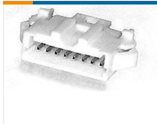
TE Part #1-292215-2 MINI CT SGL RELAY 12P NAT