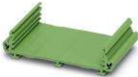
The illustration shows the variant UM 45-Profil CM

Drawn section panel mounting base, with a constructional width of 72 mm and a fixed length of 100 cm