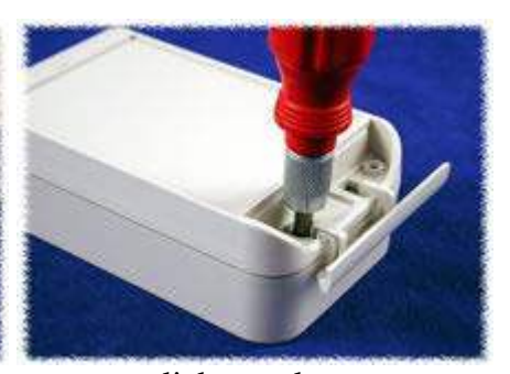
click to enlarge Enclosure can be installed after closing lid