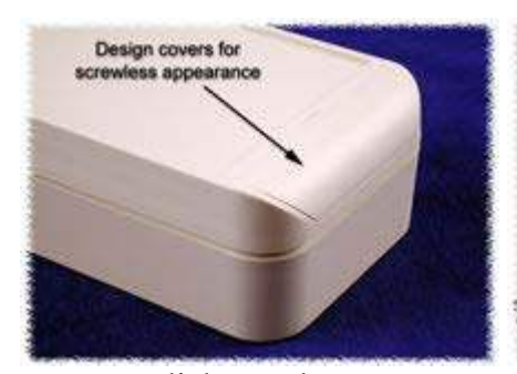
click to enlarge Removable hinged design covers hide both lid screws and installation holes