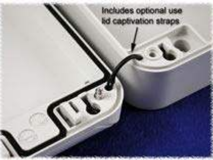
click to enlarge Includes optional use lid captivation straps