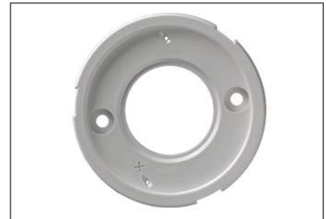
LED Array Holder for CREE* XLamp† CXA2520, CXA2530 and CXA2540 (Series 180810) Round Version