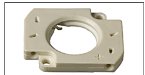
LED Array Holder for CREE* XLamp† CXA1507 and CXA1512 (Series 180560) Rectangular Version