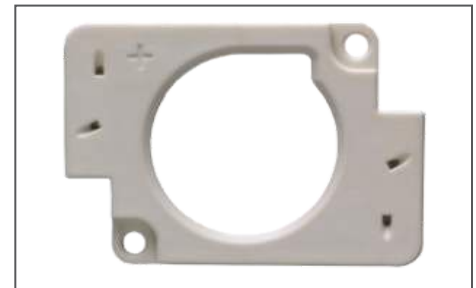
LED Array Holder for CREE* XLamp† CXA2520, CXA2530 and CXA2540 (Series 180720) Rectangular Version