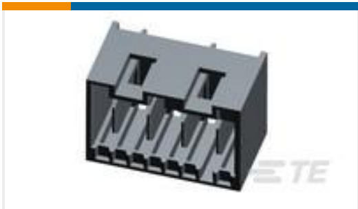
TE Part #1971845-4 4P, RAST 5 Tab Header, THV