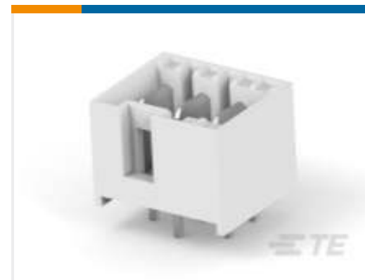
TE Part # 6-2232043-3 3P, RAST 5 Tab Header, THV