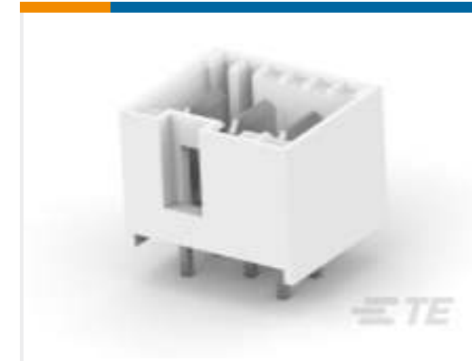
TE Part # 3-2232045-3 3P, RAST 5 TAB HEADER, THV