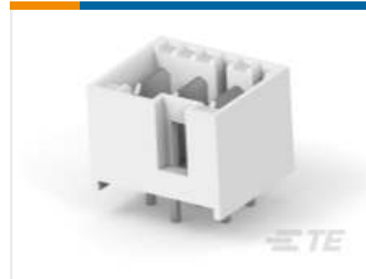
TE Part # 1-2232043-3 3P, RAST 5 Tab Header, THV