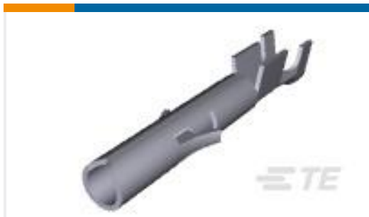
TE Part #350851-1 UMNL SOK 24-18 PTPBR