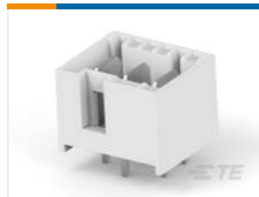
TE Part # 5-2232043-3 3P, RAST 5 Tab Header, THV