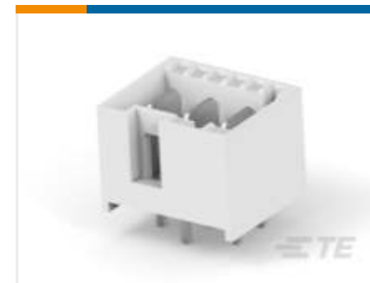
TE Part # 7-2232043-3 3P, RAST 5 Tab Header, THV