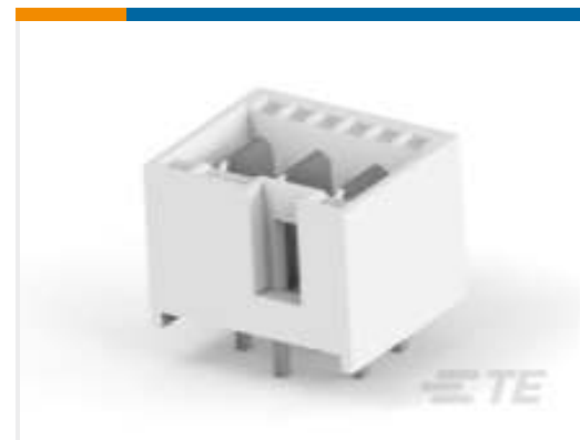
TE Part # 9-2232043-3 3P, RAST 5 Tab Header, THV