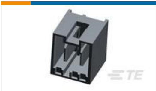
TE Part #2-1971845-2 2P, RAST 5 Tab Header, THV