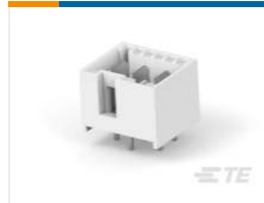
TE Part # 2-2232043-3 3P, RAST 5 Tab Header, THV