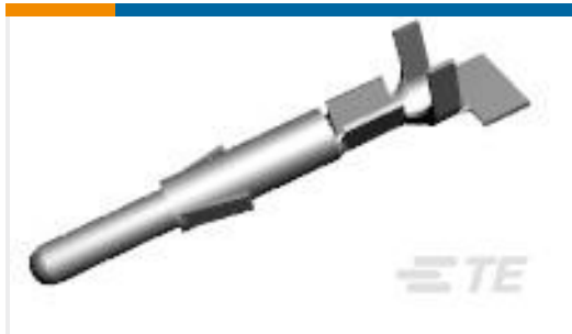
TE Part #770210-1 UMNL GRND PIN PTPBR