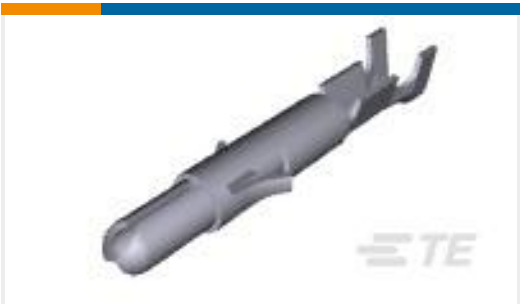
TE Part #350699-1 UMNL SPLIT PIN PTPBR