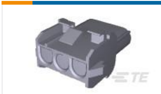
TE Part #350767-1 03P UMNL CAP HSG V0