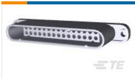
TE Part #213974-1 METRIMATE 30P RCPT HOUSING