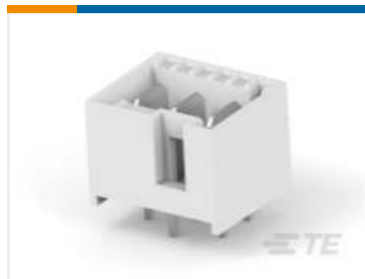
TE Part # 4-2232043-3 3P, RAST 5 Tab Header, THV