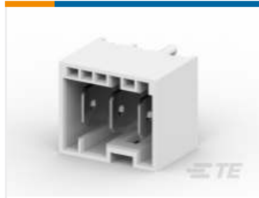
TE Part # 2292457-3 3P, RAST 5 HEADER, PL, SHROUDED