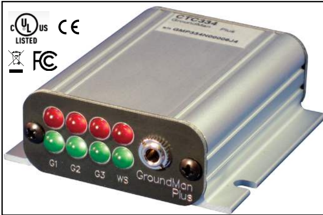
Figure 1. Ground Man Plus Ground Monitor.