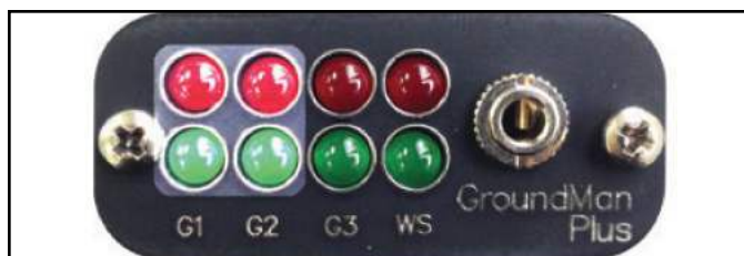
Figure 3. LED lights used to set resistance alarm level.

Verification of G1, G2 and G3 monitoring.